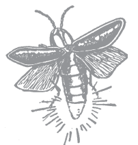
(firefly, 1/2 inch long)