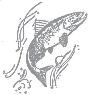
(salmon, 3 feet long)